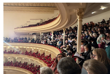
From the Dress Circle: Acts 1 and 2 prepare for the 'Hallelujah Chorus' during rehearsal at Carnegie Hall.