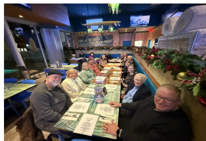
The group enjoying a meal at Landshark's in Times Square.