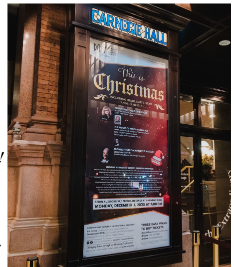
A concert poster is displayed on the Carnegie Hall marquee, announcing the performance.