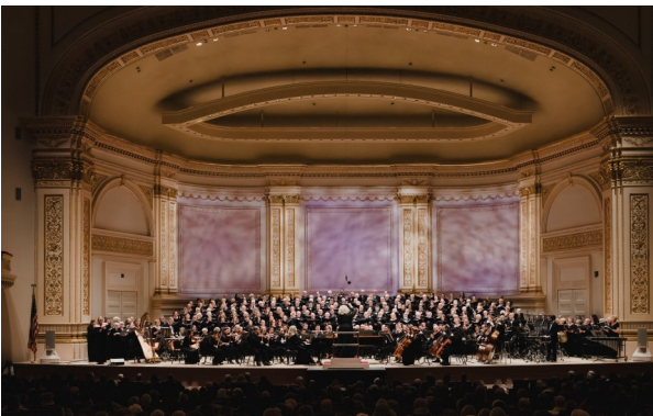
Group photo of Act 1, "This Is Christmas."