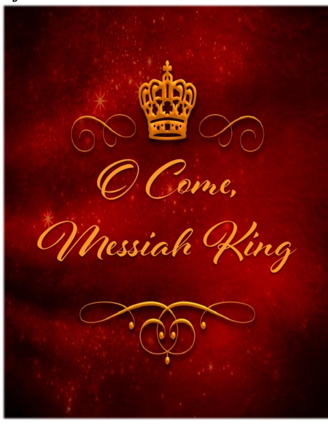
December 10, 2023 at 5:00 pm

If you would like to participate, come to an informational meeting in the Sanctuary after morning worship on Sunday, October 22, 2023. Let's "Light Up the Night" together!!